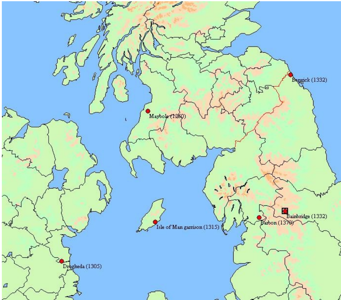
Origins, known or speculative, of residents of Barbon, Westmorland in 1332 and 1370.